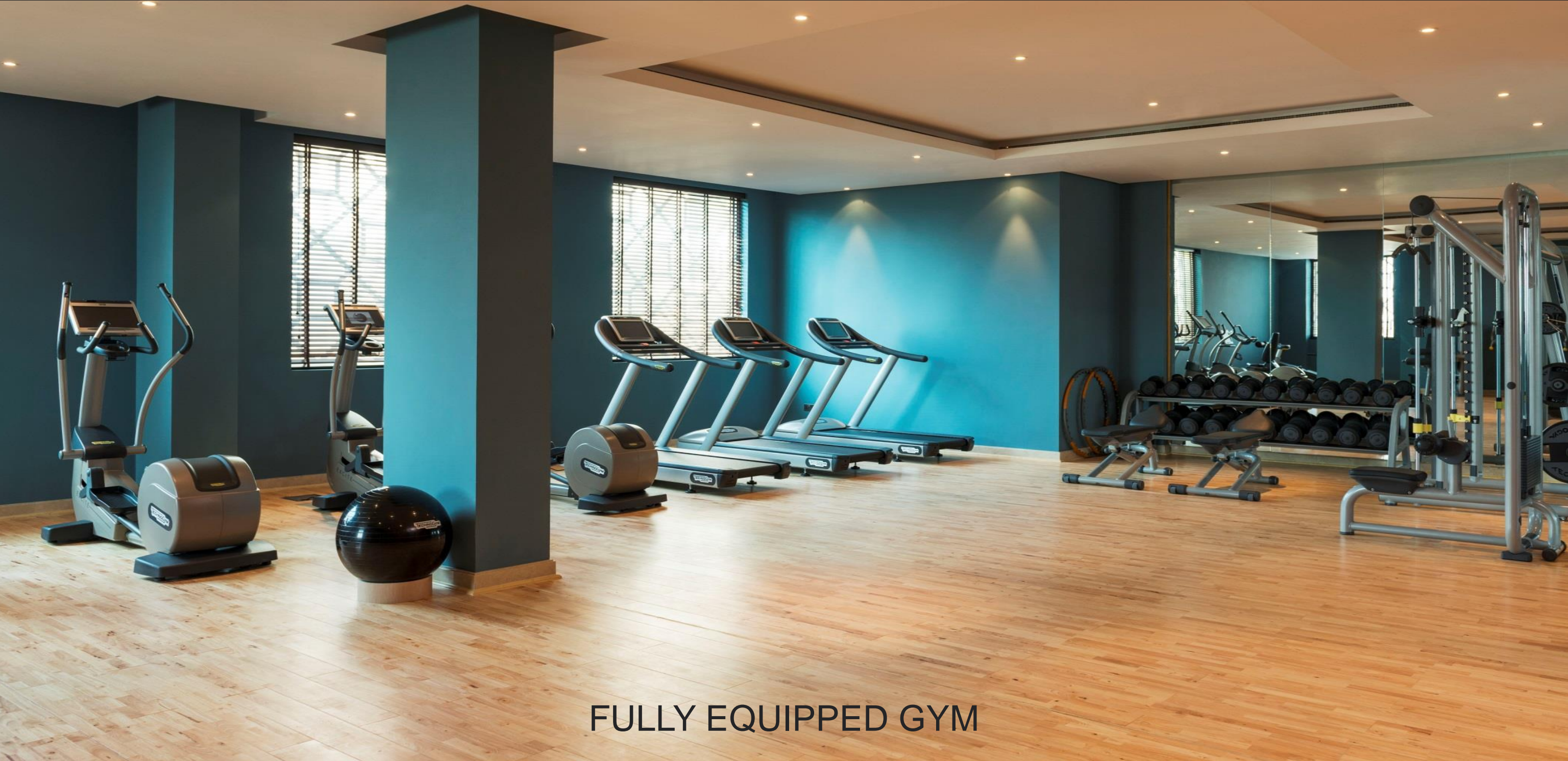
FULLY EQUIPPED GYM