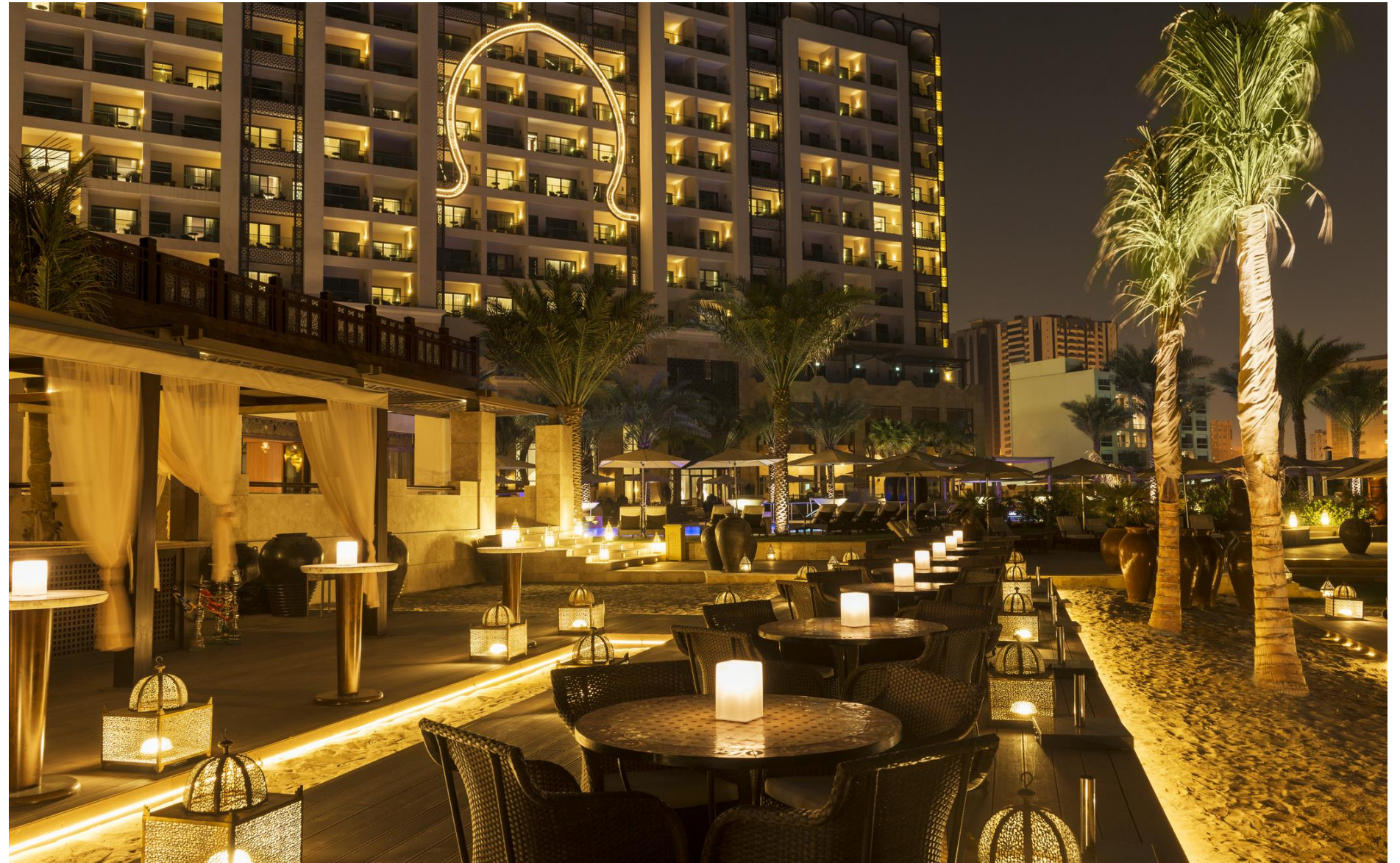
BAB AL BAHR BEACHFRONT SITTING