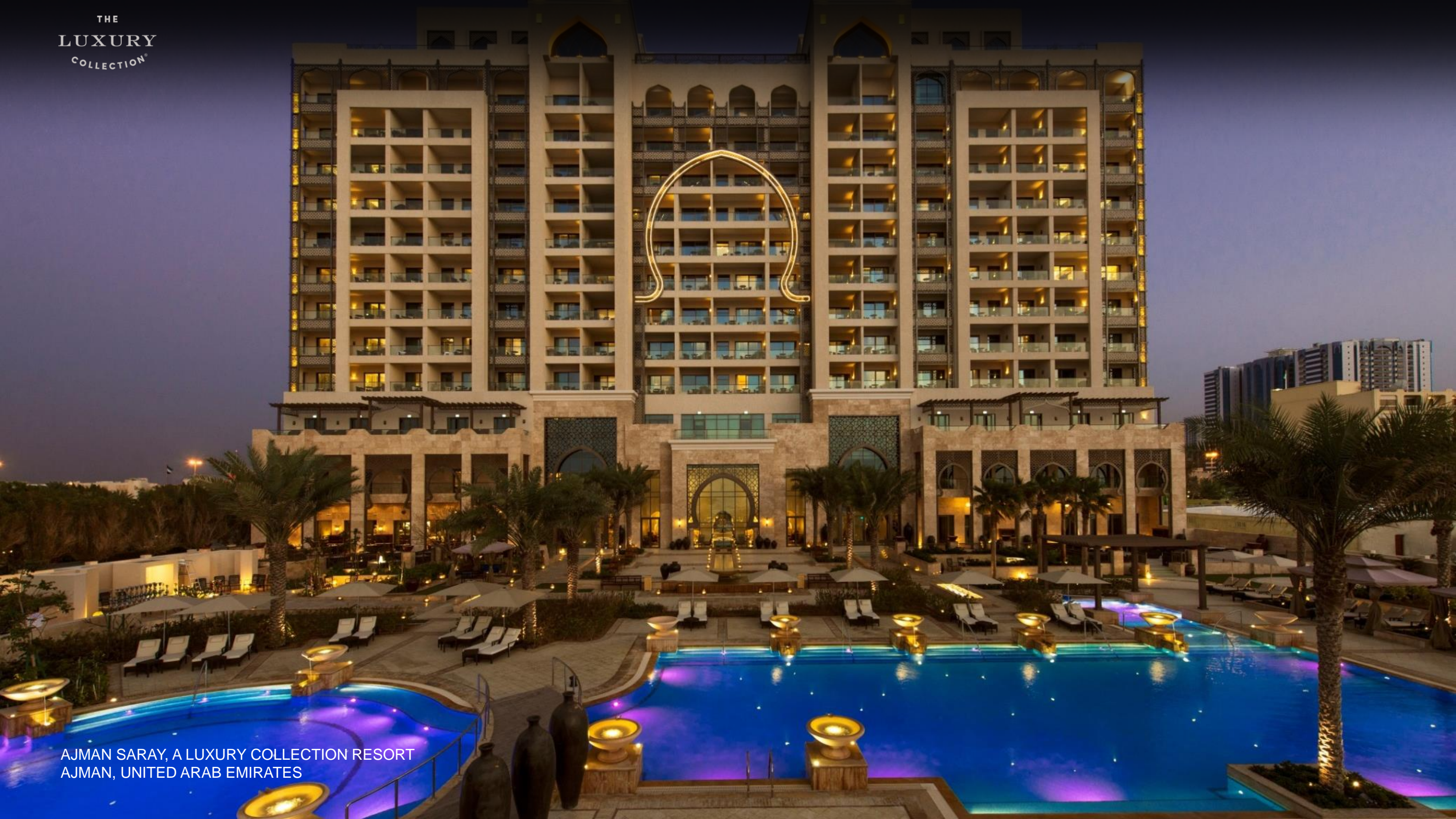
AJMAN SARAY, A LUXURY COLLECTION RESORT AJMAN, UNITED ARAB EMIRATES